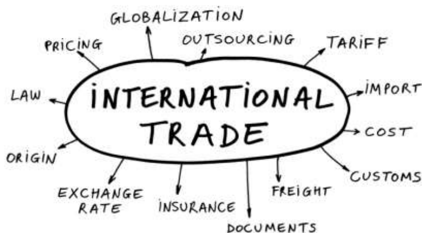
Figure 1: Fundamentals of International Trade