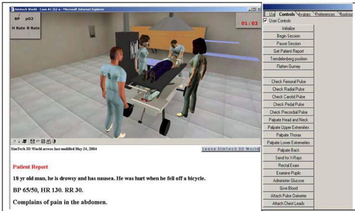
Figure 2: Virtual Simulation Source: A Virtual Simulation lab (Heinrichs et al. 2008)

understanding the pressure points of the needles as the Virtual bodies were able to show the response and that too without being hurt (Dutta 2013).