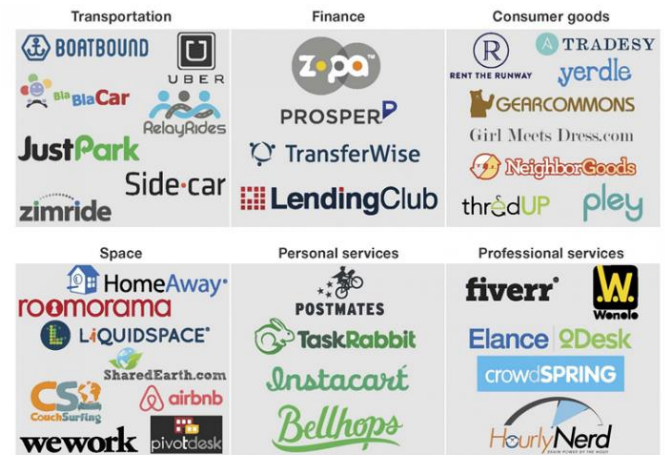
Figure 1: Types of sharing economy Startups: Transportation, Finance, Consumer goods, Space, Personal services and Professional services

Sharing economy businesses and platforms can be organized into three types: product service systems, redistribution markets, and collaborative lifestyles. Product service systems enable companies to offer goods as a service rather than sell them as products (e.g., peer to peer car sharing), in redistribution markets used or pre-owned goods are moved from somewhere they are not needed to somewhere they are (e.g., peer-to-peer online flea market). In collaborative lifestyles, people with similar needs or interest band together to share and exchange assets such as food, meals, space, and skills (Botsman, Rogers 2010).