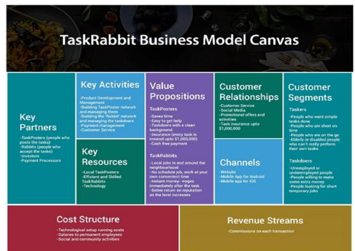
Figure 2: TaskRabbit Business Model Canvas (Deep, 2015)

TaskRabbit's value proposition is based on saving time and getting errands done easily and trustworthy. TaskRabbit earns its revenue by taking a commission on every transaction that happens over the application.