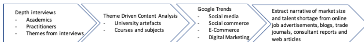
Figure 1: Bricolage Method for Research and Findings

fashion. The interviews were in the form of discussions conducted in office environment settings focusing on marketing trends and challenges for 2020-2025.