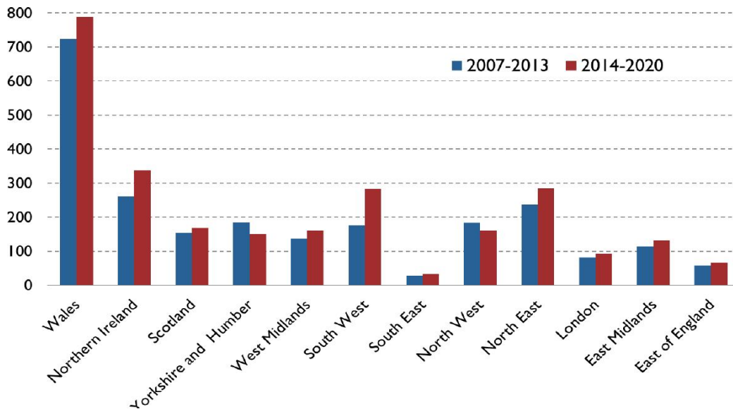
Figure 1: Regional draw down of ESIF by EU Capita 2007 – 2020

Both UK and Welsh Government strategies (UK Gov 2021 and WG, 2018) support greater collaboration between health and social care, industry, academia and the third sector to deliver greater impact and value (Davies et al, 2021) by developing, sharing and adopting innovative practice, leadership and skills development and supporting new technology development (WG, 2018). The Welsh health and social care innovation ecosystem has previously drawn significantly from ERDF and Welsh Government supported life sciences sector innovation accelerators, such as Accelerate and AGOR-IP. It has also provided both collaborative platforms for managing life sciences sector innovation in Wales and relationship brokering of key public and private sector ecosystem stakeholders locally, nationally, and internationally (Donne et al 2021). In an era of receding EU funds, Welsh Government seeks to develop a chapter of the ISW which serves the current and emerging complexities of health and social care by creating an environment in Wales which stimulates job creation, skills and training provision, RD and I and commercialisation activities.